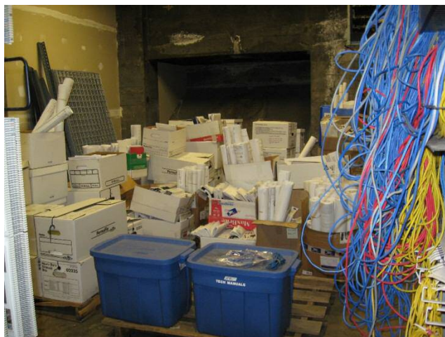
Building Construction Hand-over Project Information

Traditional facility management information specified in building construction contracts was created at the end of the construction process. It was delivered to the facility operator prior to the fiscal completion of the project, as shown below.