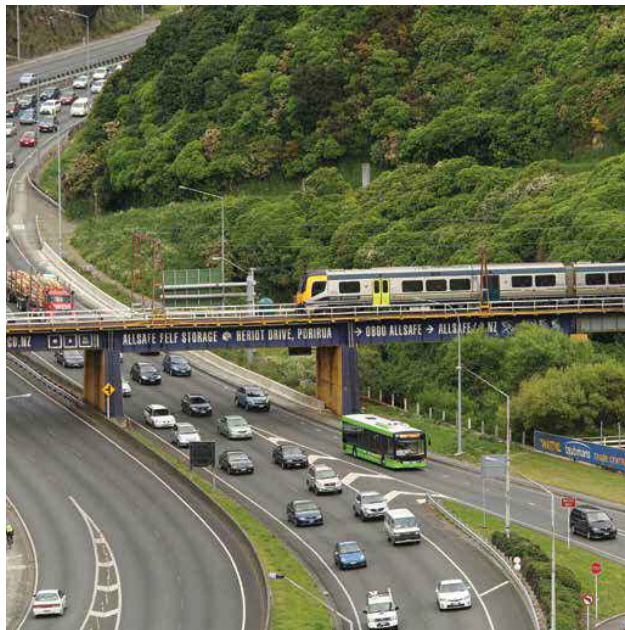
Construction to Operations for Network information exchange

In line with the small but significant change, is the proposed CONie ( Construction to Operations for Networks information exchange ). It will provide contractible methods, mandating the use of a connected digital repository (such as an SQL database) constructed to a standard specification, and suitable for automated input into redesigned compatible operations management systems.